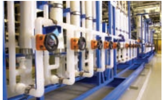
High-purity ultrafiltration system

Skilled service team provides on-site monitoring of water treatment systems.