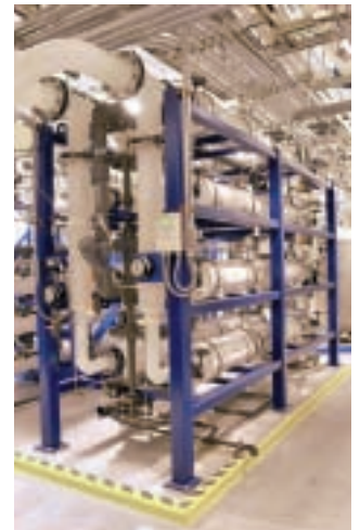
Oxygen removal system

for the facility to produce its product. The benefits of outsourced water treatment include full scale operations – 24/7, 365 days per year – by a trained staff, financing options that offset capital investment in the core business, and peace of mind that the system will be operated efficiently and seamlessly with the rest of the facility.