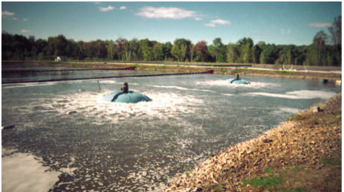
Mist Eliminator™ spray containment domes installed at municipal wastewater treatment plant

The Mist Eliminator™ domes shown below are located at a municipal wastewater treatment plant in the northeast United States. Under windy conditions, the plant would receive complaints of drifting spray and odors from nearby residents. With the addition of the Mist Eliminator™ spray containment domes, complaints have ceased and the plant continues to meet operational requirements.