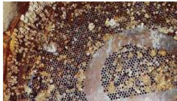
Before - Typical fouled condenser tube plate

Chloropac® systems produce, insitu, a dilute, safe solution of sodium hypochlorite for direct injection into the water circuit. Our advanced electrolyzer technology, available in a choice of basic cell designs – coupled with our long standing expertise in anode and system development – has freed thousands of customers worldwide from the cost of purchasing and the danger of handling harsh chemicals associated with other technologies.