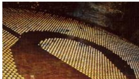
After - CHLOROPAC® system clean condenser tube plate