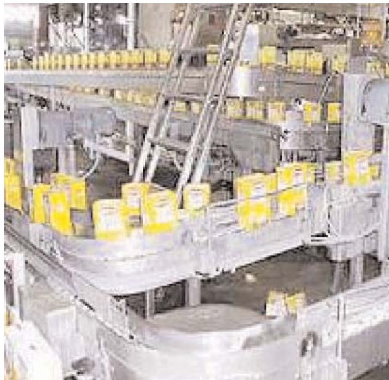
Manufacturing Facility at Granador Juice

To meet all of the project challenges, the AGAR® Moving Bed Bioreactor (MBBR) with a 1.3 hours retention time was the only solution. This innovative fixed-film moving bed process uses thousands of special suspended biomass carriers designed to create a large total surface area for biofilm growth – enhancing the biological wastewater treatment process without increasing the plant footprint. The AGAR® MBBR is ideal for handling the organic loads in food industry wastewater.