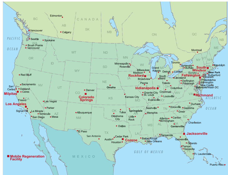
Siemens Water Technologies North America Service Network