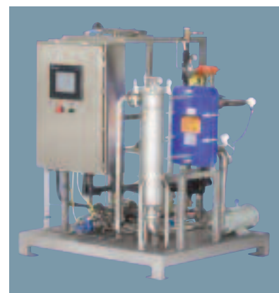
The 150 gpm HOT Series System is capable of operating in conjunction with one to three carbon towers.

Finally, a short rinse cycle (filter to waste) is used to re-settle the bed and displace the backwash water. The system can now be placed on-line with assurance of a near zero bacteria count.