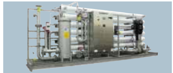
Stainless Steel Select package