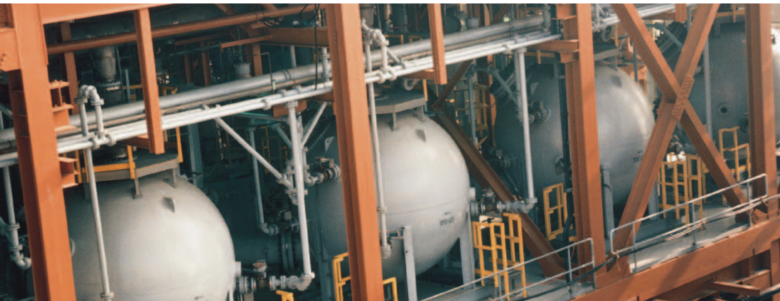
High Pressure, Deep Bed Cation/Mixed Bed Condensate Polishing System