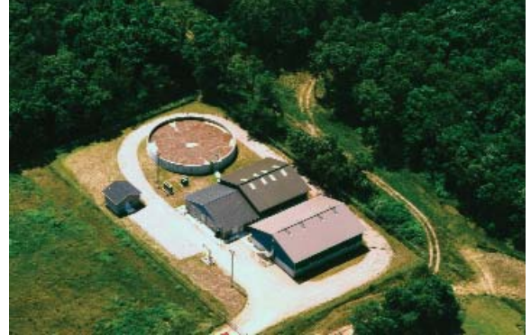
Ho-Chunk Nation Wastewater Treatment Facility

The Ho-Chunk nation agreed to go forward with this contract based on the trust of the companies involved