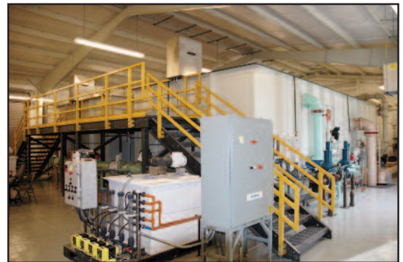
The 3 mgd surface water treatment plant produces drinking water with a turbidity level of less than 0.14 NTU combined filter effluent.

Raw water is pumped through a static mixer where a coagulant (ferric) is added, followed by inline injection of polymer. After the static mixer, the flow is split into two 1,050-gpm Trident HS units, followed by ultraviolet and sodium hypochlorite disinfection.