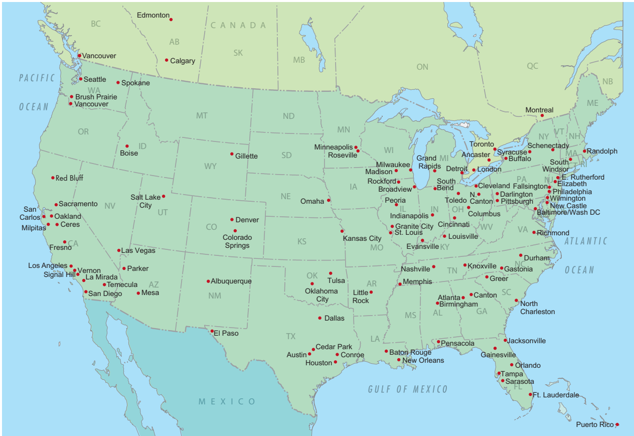
Siemens Water Technologies North America Service Network