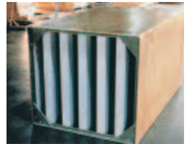
Prefabricated CPI plate rack, designed for easy removal as an assembly.

Siemens Water Technologies 411 Commercial Parkway Broussard, LA 70518 tel: 337.837.3071 fax: 337.837.9908 email: monosep.water@siemens.com