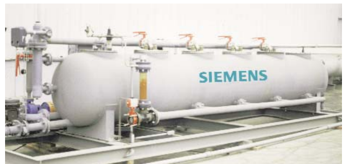
Hydrocell® separator cylindrical design.

Siemens Water Technologies 411 Commercial Parkway Broussard, LA 70518 tel: 337.837.3071 fax: 337.837.9908 email: monosep.water@siemens.com