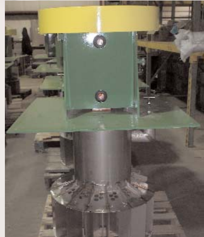
Quadricell® separator agitator