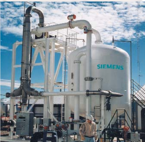
Auto-Shell™ walnut shell filter