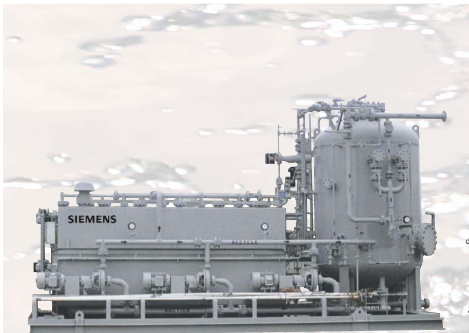
Combosep™ system includes our Veirsep™ and Spinsep™ systems

301 West Military Road Rothschild, WI 54474 Tel: 715.359.7211 Fax: 715.355.3532 email: zimpro.water@siemens.com www.siemens.com/water