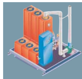
L-Series Triplex System

Siemens Water Technologies 12316 World Trade Drive, Suite 100 San Diego, California 92128 Phone: 858-487-2200 E-Mail: odorcontrol.water@siemens.com