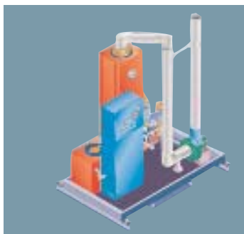
L-Series Simplex System