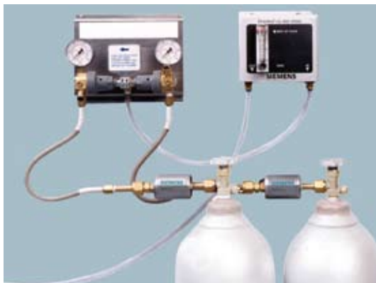
Dual Cylinder Configuration (CO 2 system with CO 2 dual tank switchover regulator shown)

CO 2 -10 Automatic dual tank switchover with gauges for nominal cylinder pressure without pressure regulator. Used in conjunction with CO 2 -5.