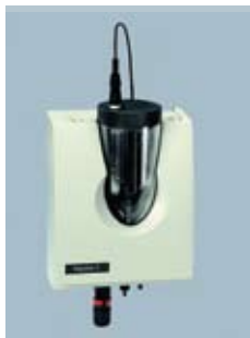
Depolox® 5 cell

This deluxe flow block assembly includes all of the features of the above Depolox® 3 plus cell, except that an integral multi-sensor provides a PT 1000 temperature measurement and output and monitors sample flow to provide a loss-of-flow alarm contact.