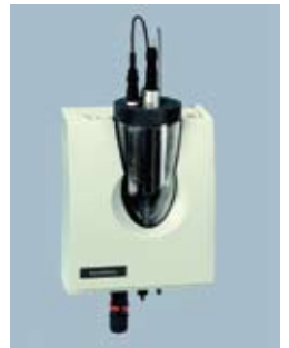
VariaSens™ Flow Cell

In addition to the above, this flow block assembly utilizes an integral flow regulator to maintain the sample flow at a constant 33 l/h. An integral multi-sensor provides a PT 1000 temperature measurement and output and monitors sample flow to provide a loss-of-flow alarm contact.