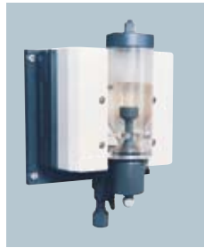
Bare-Electrode Measuring Cell

This economical flow block assembly consists of a transparent Plexiglas body with an integral flow regulator to supply a consistent sample flow to the measuring electrodes. An integral PT 100 sensor provides for temperature compensation of the chlorine residual reading as well as a temperature measurement output signal. An additional sensor probe for pH or Fluoride can be added through the flow cell cover.