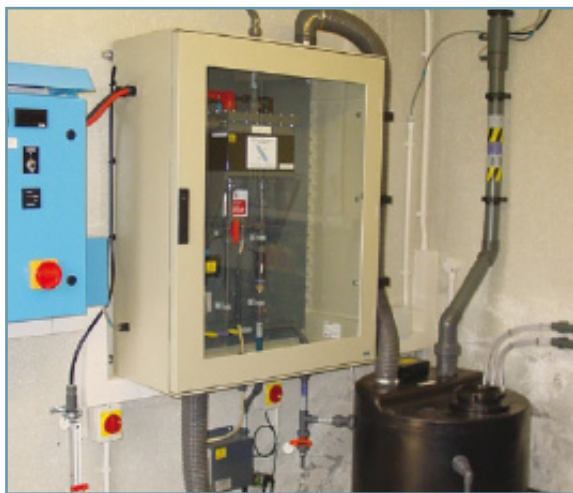
Electrolyser in Enclosure

In addition to the above, a metering pump is typically provided to meter the sodium hypochlorite to the