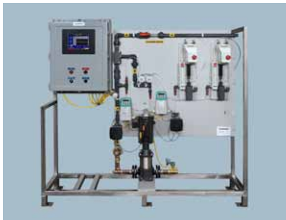
Standard configuration shown

The Millennium III™ C-Auto Series generators are available in a range of capacities all utilizing a standard modular design and a smaller installed footprint than other currently available automatic generators. Options available include a multi-port ClO 2 batch injection skid, SFC / MFC series controller with Depolox® 5 flow cell and Micro/2000® real time ion specific chlorine dioxide residual analyzer, ORP and pH monitors, and GMS + chlorine dioxide in-air monitors.