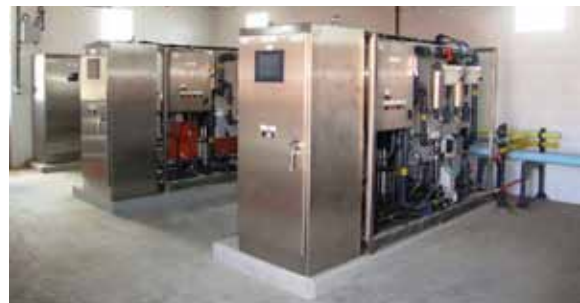
Shown with upgraded custom stainless steel panel

The reaction of sodium chlorite solution and chlorine gas shall take place under vacuum without the use of a separate mineral acid feed or the excess chlorine method (adding chlorine in excess of the stoichiometric chlorine requirements in order to lower the process pH). Excess chlorine shall be considered as any amount greater than 10% of the stoichiometric chlorine requirement that remains in the generator product stream as unreacted chlorine. Yield shall be defined as the ratio of chlorine dioxide generated to the theoretical stoichiometric maximum. The theoretical maximum shall be determined from the feed rates of the chemical reactants. They shall be confirmed by an Amperometric analysis capable of differentiating between chlorine, chlorine dioxide, chlorite and chlorate ions. Analysis shall be confirmed by the procedure as described in Standard Methods for the Examination of Water and Wastewater, APHA-AWWAWEF, 20th edition 1998, Amperometric Method II, 4500-CIO2E.