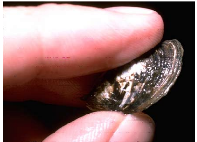
Adult Zebra Mussel

Siemens Water Technologies Germany +49 8221 9040 wtger.water@siemens.com