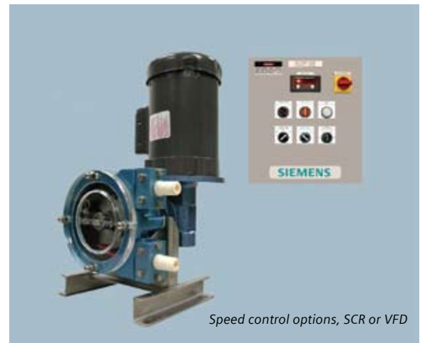
Speed control options, SCR or VFD