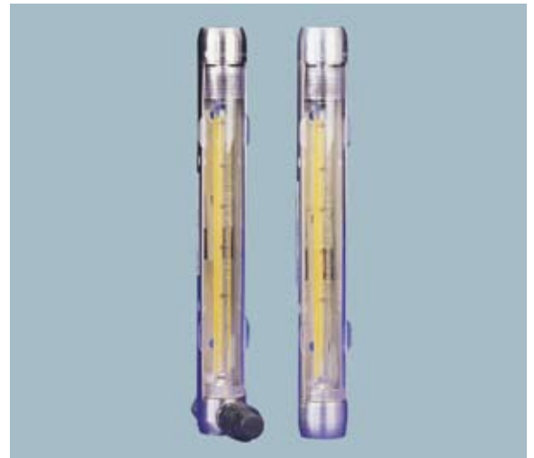
Low Flow Meter

A Wallace & Tiernan® Flow Controller keeps flow constant regardless of pressure variations. It comes in brass or 316 stainless steel, in inlet or outlet configurations and high or low capacities. Replaceable seat adapters make for easy capacity changes. Straight-through design means the controller can be threaded directly into the meter body, eliminating pipe nipples and static piping.