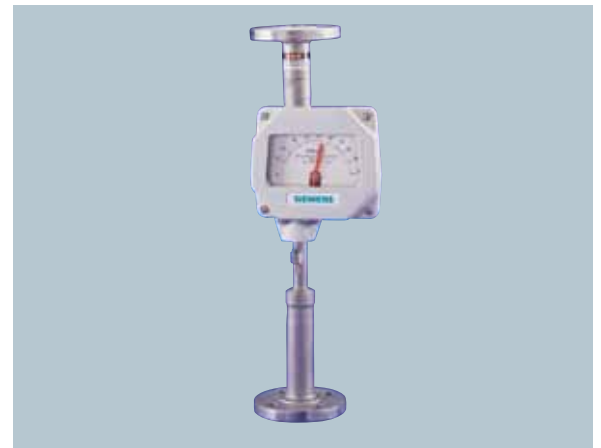
Metal Tube Varea-Meter® Unit

Straight Through Varea-Meter® units can be bench calibrated. After mounting in process piping, a minor zero adjustment is made with a screwdriver. There is no need to break piping to get at the top of the meter when making this adjustment.