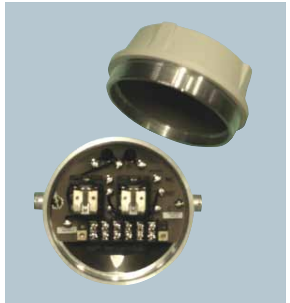
Flow switch with switches and relays