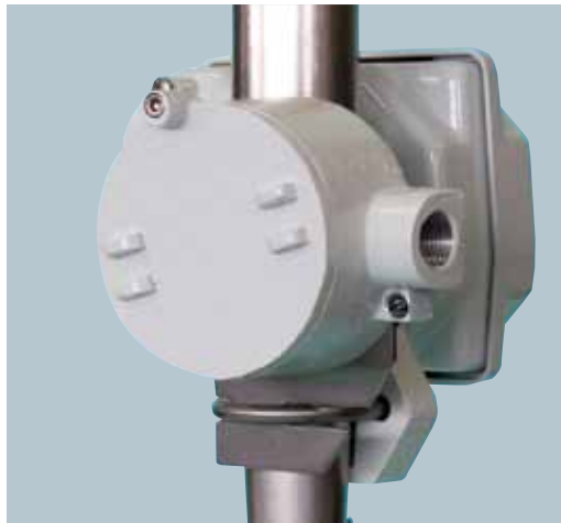
Electronic Flow Transmitter mounted on meter body

Dimensions – For complete dimensions, please refer to literature: WT.520.205.102.UA.CN