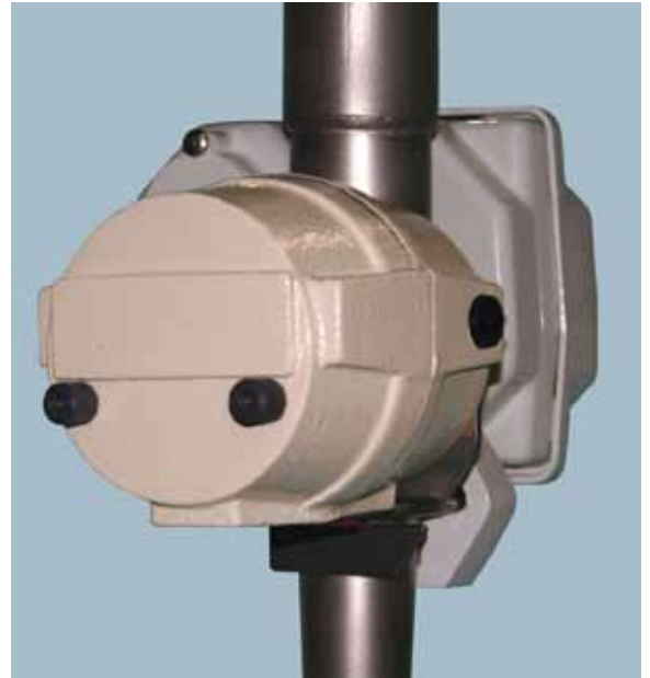
External flow switch mounted on meter body

Dimensions – For complete dimensions, please refer to literature: WT.520.205.106.UA.CN.