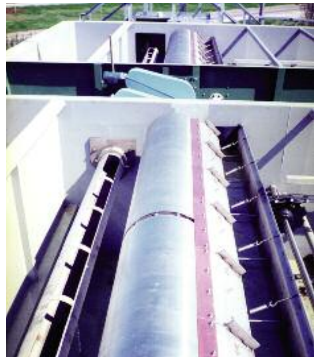
Oil roll skimmers ensure safe and efficient removal of collected oils.