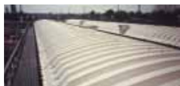
Our fixed VOC containment cover systems reduce the risk of explosions by using an inert gas, such as nitrogen, instead of air.